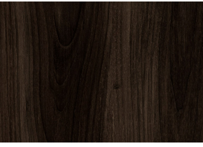
LIFE 667 NOCE MOSCATO

PANEL THICKNESS 1/4 to 1 1/2 6mm to 38mm PANEL FORMAT 48 x 97 245mm x 2464mm 61 x 97 1550mm x 2464mm 1550mm x 307333 61 x 121 SUBSTRATE OPTIONS Spec Lam Spec Green Spec MDF Spec Ply CERTIFICATIONS CARB II NAF TSCA Title VI FSC