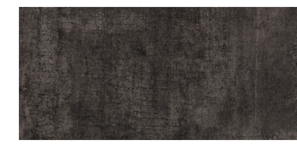
SP 669 SKYLINE DARK