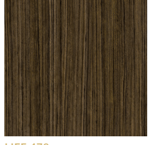
LIFE 478 LINEA DUSK