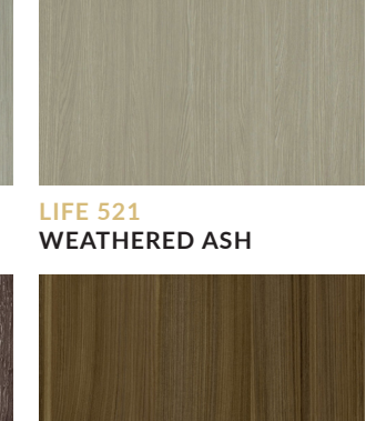
LIFE 674 STINSON UMBER