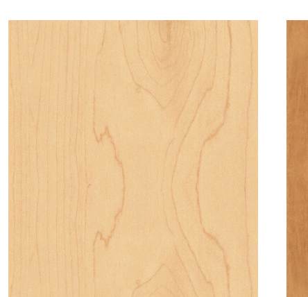
SP 306 CHAPEL HILL MAPLE