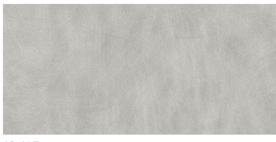
SP 687 PLATINUM GLANCE