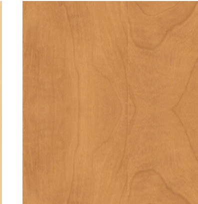
SP 614 CANDLELIGHT APPLE