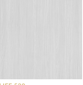
LIFE 520 WHITE ASH

6mm to 38mm PANEL THICKNESS 1/4 to 1 1/2 245mm x 2464mm PANEL FORMAT 48 x 97 61 x 97 1550mm x 2464mm 61 x 121 1550mm x 307333 SUBSTRATE OPTIONS Spec Green Spec Lam Spec MDF Spec Ply CARB II NAF CERTIFICATIONS TSCA Title VI FSC