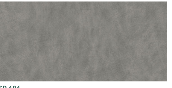
SP 686 SILVER GLANCE