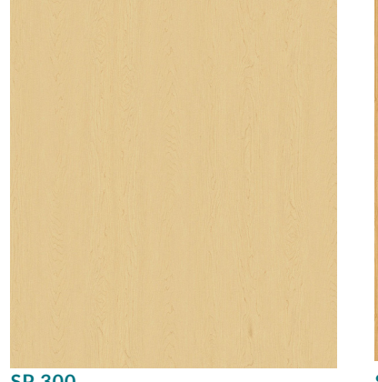
SP 300 HARDROCK MAPLE