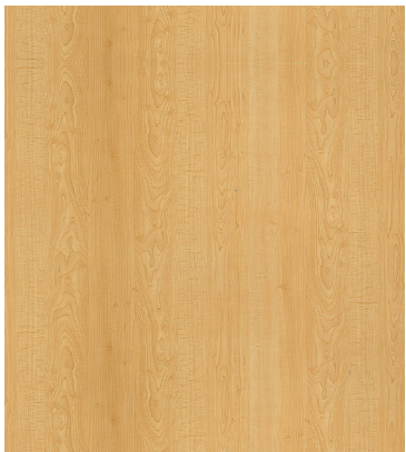
SP 302 NATURAL MAPLE