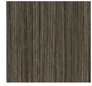
LIFE 480 LINEA TWIGHLIGHT