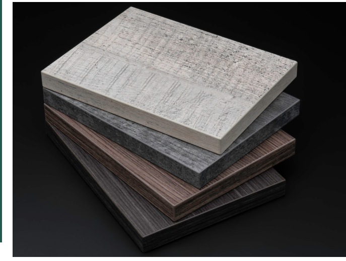
Make a statement with our Abstract TFL Collection. Designed to make your space stand out, this collection was created with innovators in mind. A highly customizable collection which will elevate your project to new levels. Our Abstract Collection draws on industrial design elements to give projects a multidimensional look and feel.