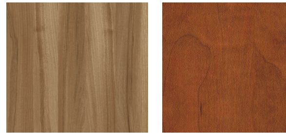
SP 600 SP 474 STOCKHOLM WALNUT COGNAC