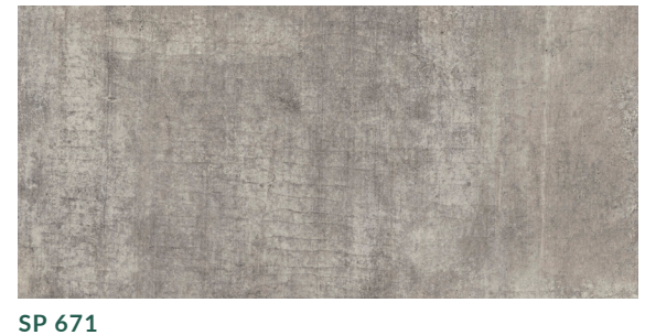
SP 671 SKYLINE DUSK