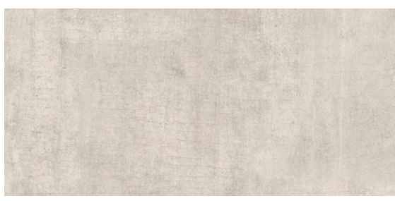
SP 670 SKYLINE DAWN