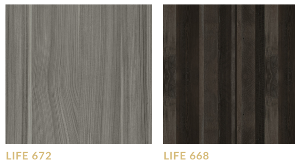
LIFE 668 STINSON GRAY PAPA'S LOFT