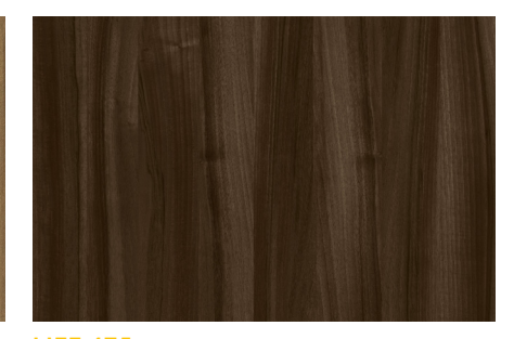
LIFE 475 HYGGE WALNUT