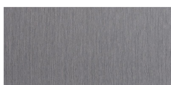
SP 703 BRUSHED METAL