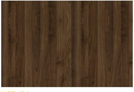
LIFE 484 ALEXANDRIA WALNUT