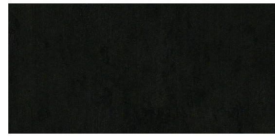
SP 656 CAULDREN